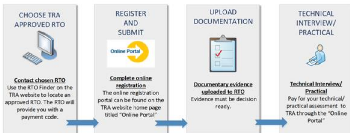
Diagram 2: OSAP Application Process